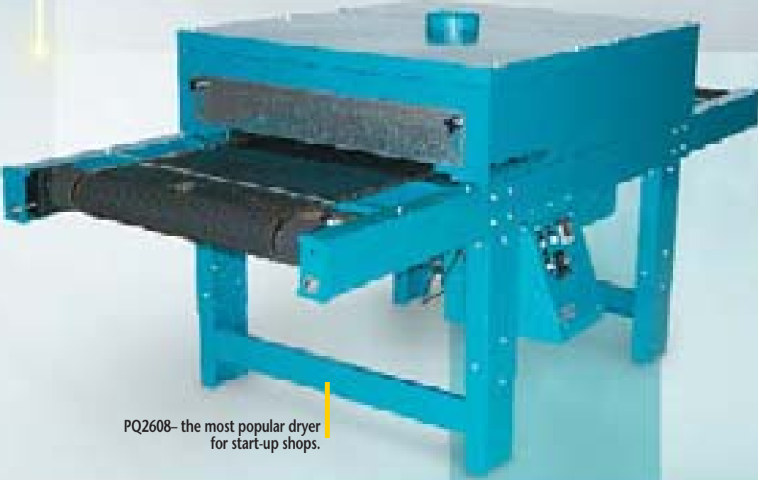
PQ2608- the most popular dryer for start-up shops.