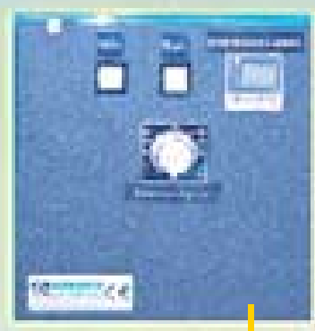
Digital Temperature Control Flash Phase Cure Booster Adjustable Belt Speed